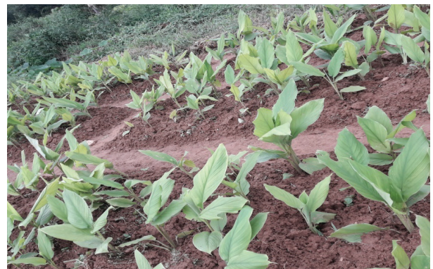
Fig. 4. Research plot at HARS, Pottangi

Field experiment was conducted at High Altitude Research Station (HARS), Pottangi, Koraput under Odisha University of Agriculture and Technology (OUAT), Bhubaneswar (Fig. 4). Field trials were laid out with six treatments and three replications in Randomized Block Design. Forty rhizomes were planted on raised beds of 3 x 1 m size at a spacing of 30 x 25 cm. Nitrogen, phosphorus and potassium (NPK) were applied @ 60 kg ha -1 , 30 kg ha -1 and 90 kg ha -1 respectively in the form of urea, single super phosphate and muriate of potash as basal and top dressing. Fungicides such as Flusilazole + Carbendazim (0.1%), Hexaconazole (0.1%), Thiophonate Methylate (0.1%), Azoxystrobin + Tabuconazole (0.1%) and Carbendazim + Mancozeb (0.15%) were applied separately by dipping rhizomes in the fungicide solution before planting followed by foliar application at 60 and 90 DAP. There were six treatments including control.