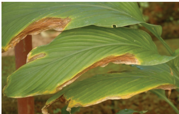
Fig. 3. Symptoms of leaf blotch of turmeric (late stage)