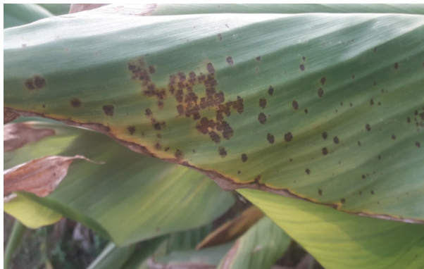
Fig. 2. Symptoms of leaf blotch of turmeric (early stage)